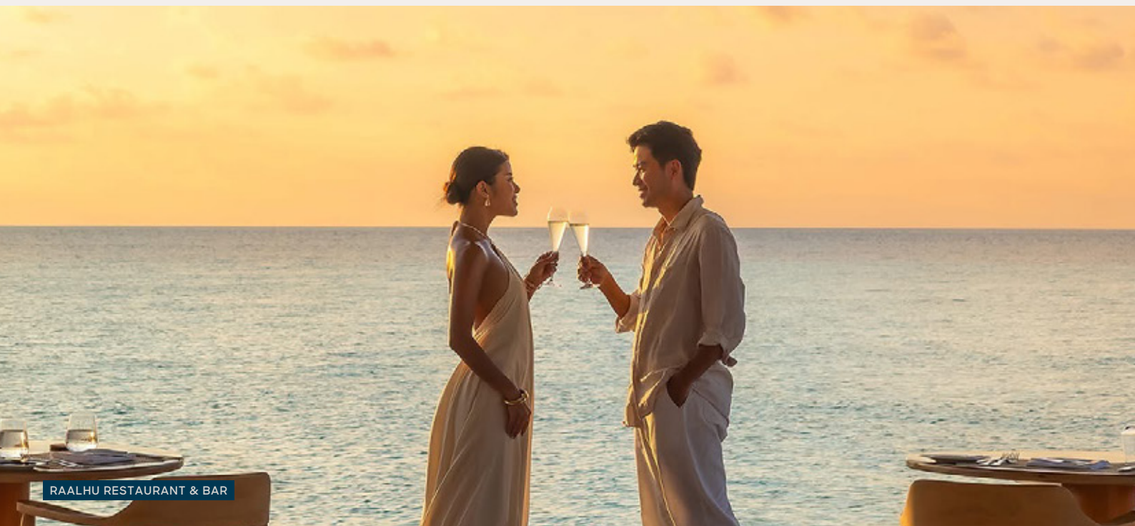
RAALHU RESTAURANT & BAR

Raalhu Champagne Pavilion is a paradise of pleasure for those who long for the sight and taste of champagne and the magical colors of the setting sun. This luxurious spot offers some of the world's finest champagnes as the sun paints its hues of twilight in the sky. It is the perfect place for newlyweds and lovers to truly reconnect and celebrate their special love.