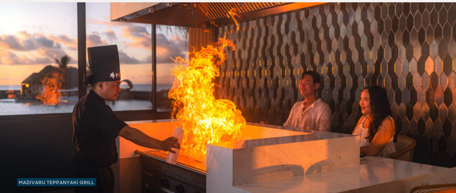
MADIVARU TEPPANYAKI GRILL

The culinary creations feature hand-picked ingredients sourced from Veligandu's lush natural gardens and nearby local islands, ensuring that each dish bursts with freshness, flavor, and vibrant colors.