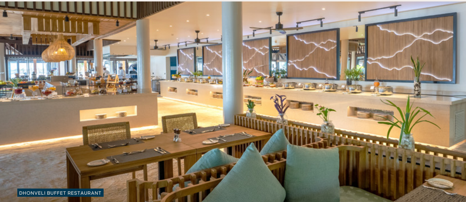
DHONVELI BUFFET RESTAURANT

Veligandu has elevated its island culinary offering with a combination of casual gourmet and fine dining experiences . Guests can be swooned away in the buffet restaurant, as well as explore the dine-around options during their stay in the two modern à la carte restaurant options or relax and stay indoors while exploring the in-villa dining menu . On top of it all, guests also have access to the Infinity Pool and Snack Bar Menu , with a serene ambiance of stunning views for a leisurely brunch, lunch, or late afternoon snack that will leave the palate enticed for more.