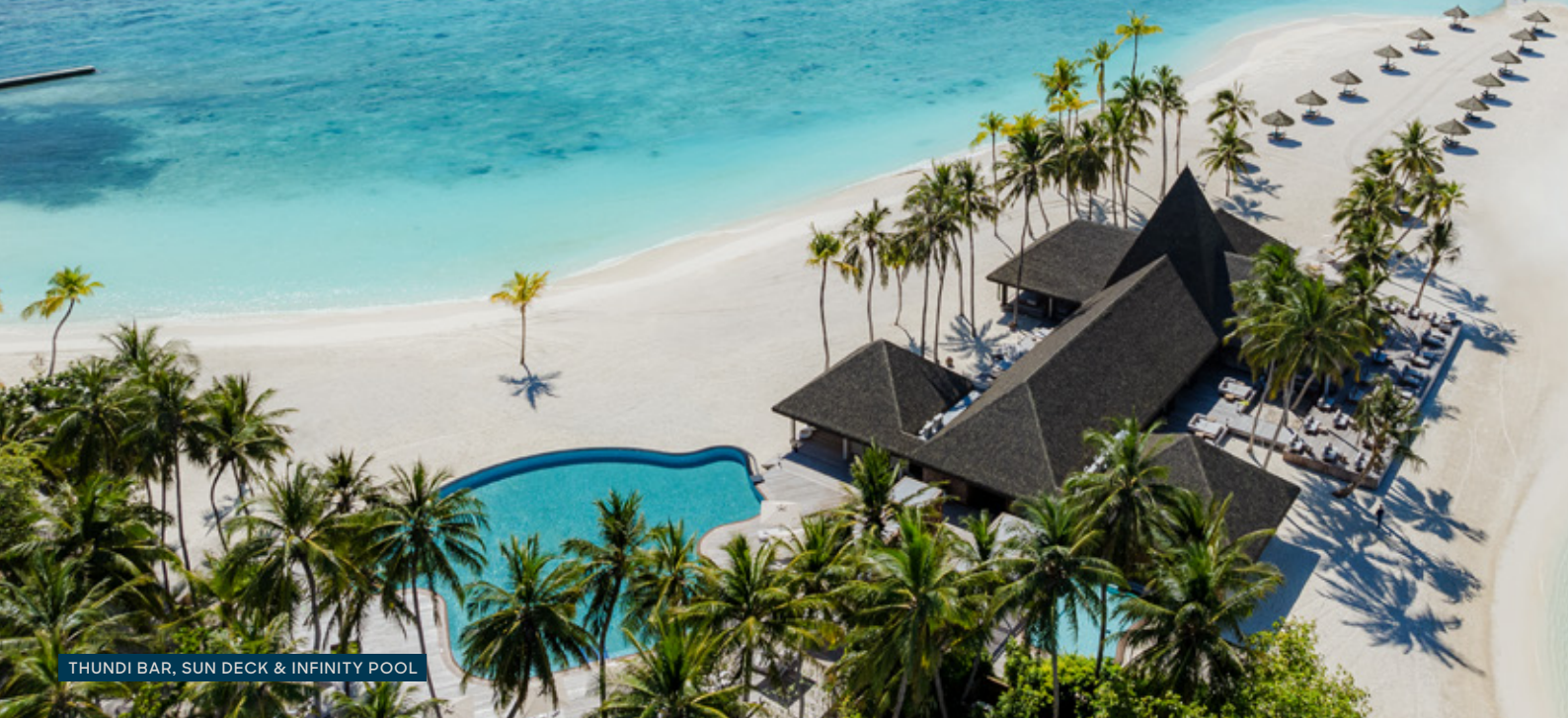
THUNDI BAR, SUN DECK & INFINITY POOL