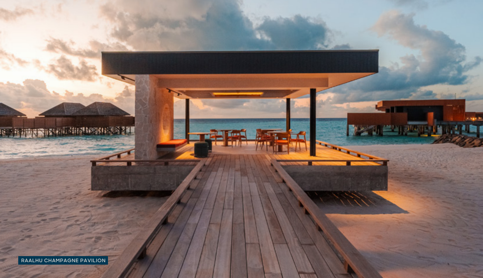
RAALHU CHAMPAGNE PAVILION