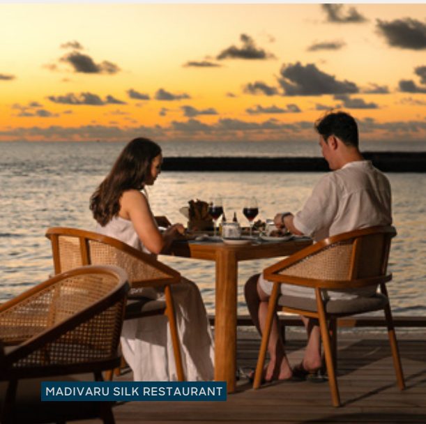
MADIVARU SILK RESTAURANT

Step into a culinary adventure at MADIVARU–The Silk Restaurant & Teppanyaki Grill, where ancient trade routes serve as the muse for each dish.