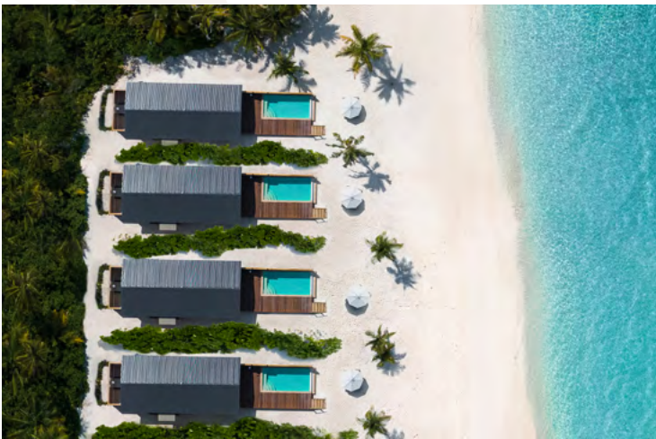
Sunset Beach Pool Villas (130 sqm)

Experience romance and relaxation in one of our beach villas. Your private escape. Embrace Island life where comfort blends seamlessly with nature for the ultimate getaway