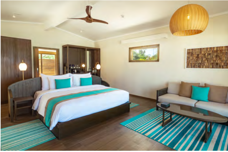
Sunrise Beach Villas (98 sqm)

Wake up to the breathtaking ocean views in our Sunrise Beach Villas. Embrace the Maldives in a place where the warmth of the morning sun and the comfort of nature create the perfect escape