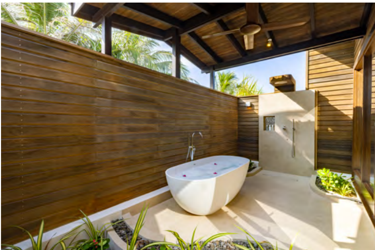
Romantic Beach Villas (98 sqm)

Wake up to the breathtaking ocean views in our Sunrise Beach Villas. Embrace the Maldives in a place where the warmth of the morning sun and the comfort of nature create the perfect escape