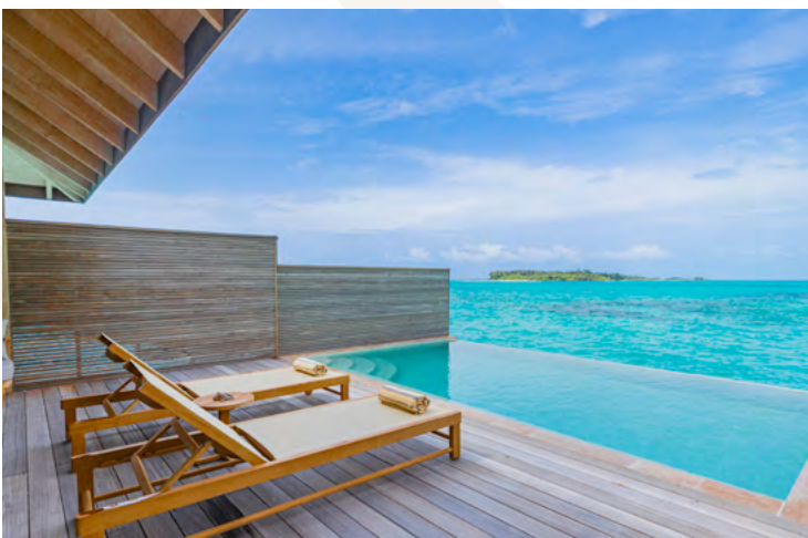
Ocean Pool Villas (119 sqm)

Offering private pools and stunning ocean views. Escape to one of our beach villas with private pool. A secluded place where sun, sand and serenity await