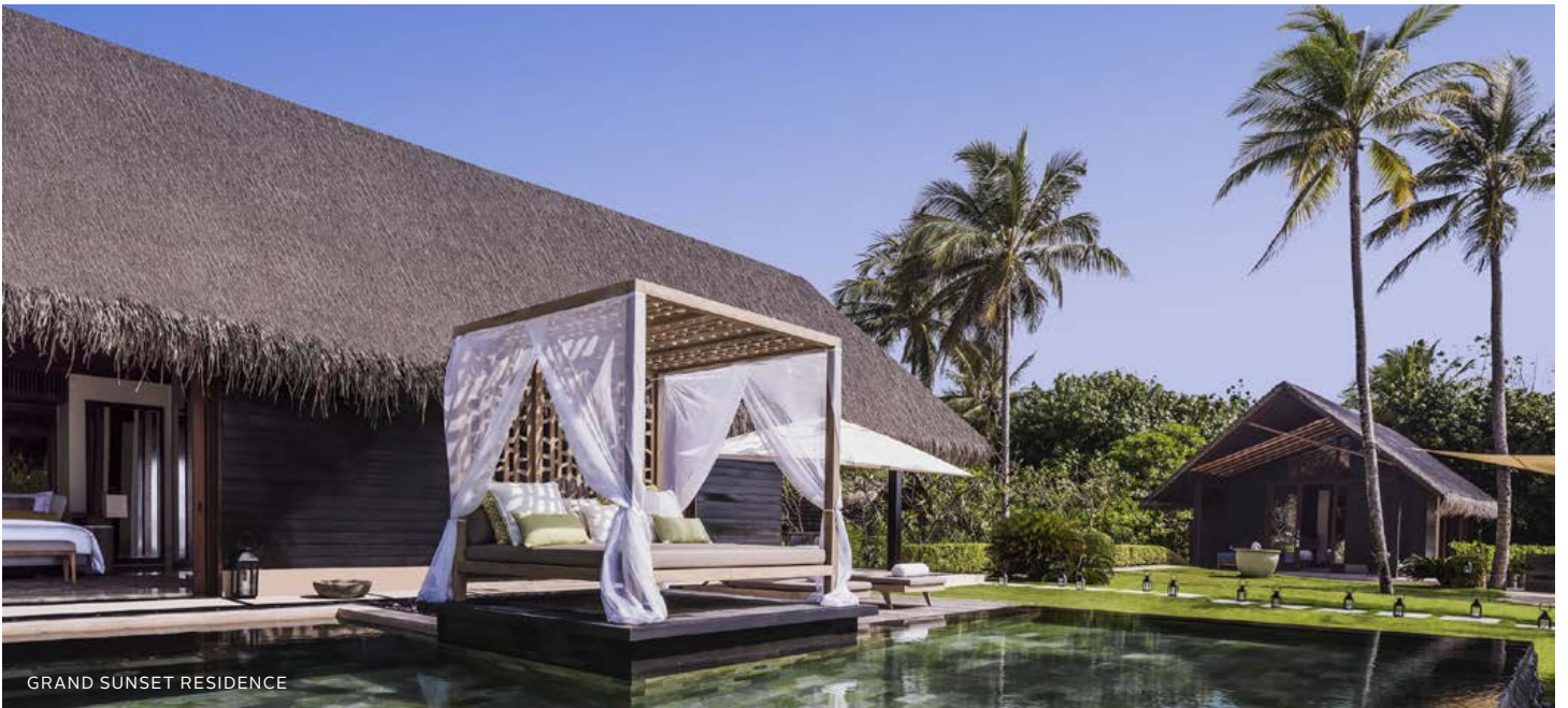
GRAND SUNSET RESIDENCE