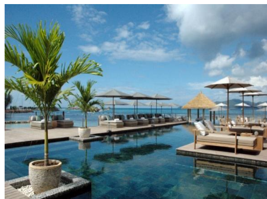
Sea & Pool View

INFINITY POOL BAR – A swim-up pool bar for enjoying refreshments from the cool confines of the pool overlooking the sea.