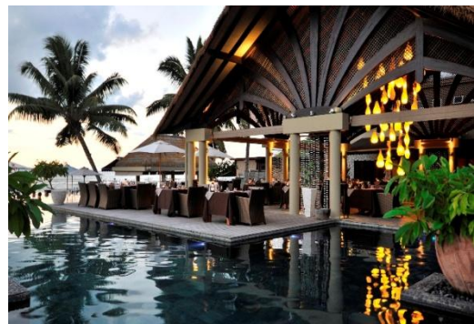
Le Combava Restaurant