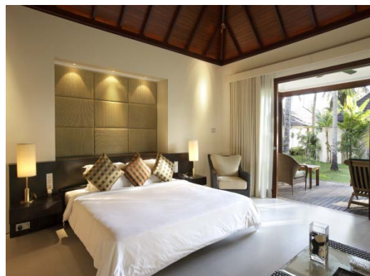
King Garden Villa