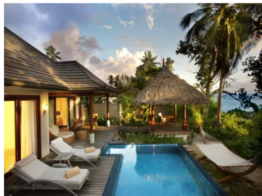
Deluxe Beachfront Pool Villa

Pool Villas additionally have separate dressing room, circular bathtub for two, espresso machine, sundeck and private pool. Presidential Villa has two bedrooms, living room, lounge area, large outdoor dining area, sundeck, large private pool, private beach access and butler service.