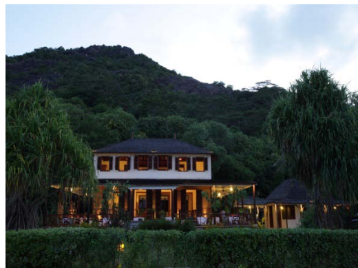
Gran Kaz Creole Restaurant

The Silhouette Spa, built into pre-existing ancient granite rock formations, has six double treatment rooms around an impressive courtyard of rock, stone and jungle.