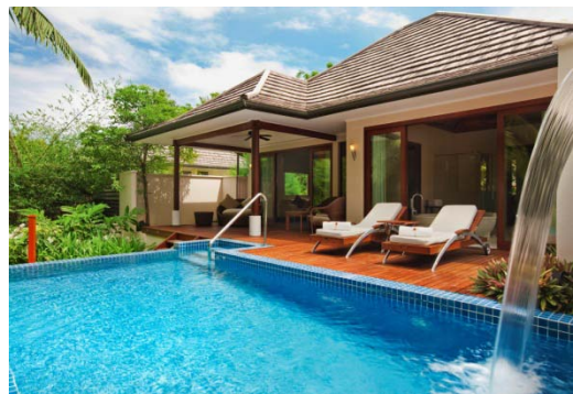
Deluxe Hillside Pool Villa