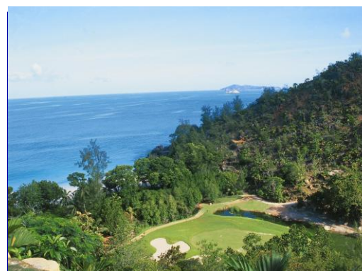
Partial View of Golf course