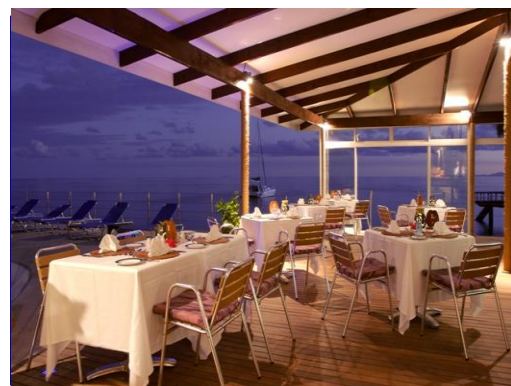
Mango Terrace restaurant