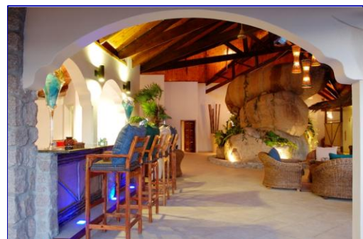
Black Parrot Bar